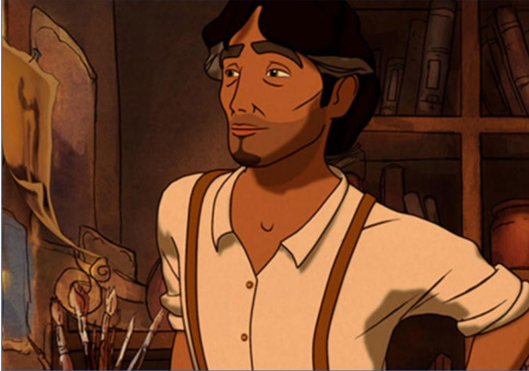
'Kahlil Gibran's The Prophet'

GKIDS, the American distributor behind 2015 animated Oscar nominees "The Tale of the Princess Kaguya" and "Song of the Sea," has picked up North American rights to "Kahlil Gibran's The Prophet." This animated telling of Gibran's bestselling 1923 book played the festival circuit, including a Cannes premiere, last year. It has been slated for a summer 2015 release.