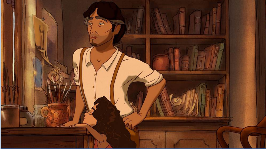
'Kahlil Gibran's The Prophet'

GKIDS, a distributor of award-winning animation for both adult and family audiences, has acquired the North American rights to "Kahlil Gibran's The Prophet," a film inspired by the beloved classic book by Kahlil Gibran.